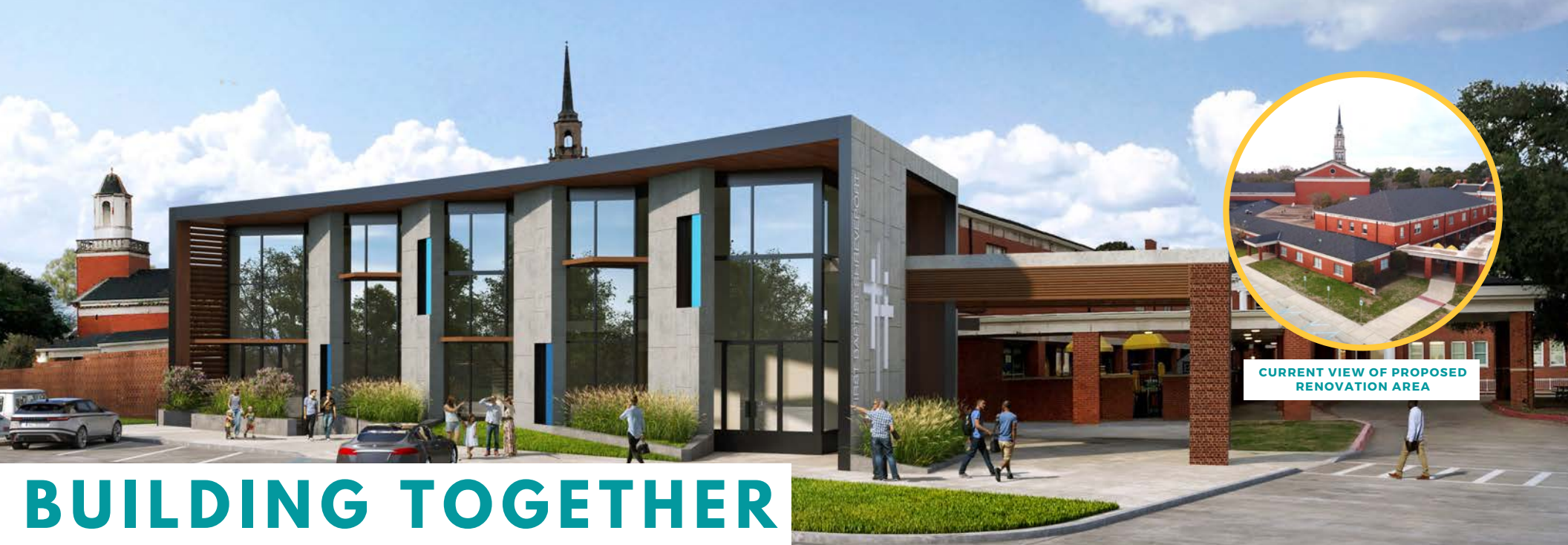
CURRENT VIEW OF PROPOSED RENOVATION AREA